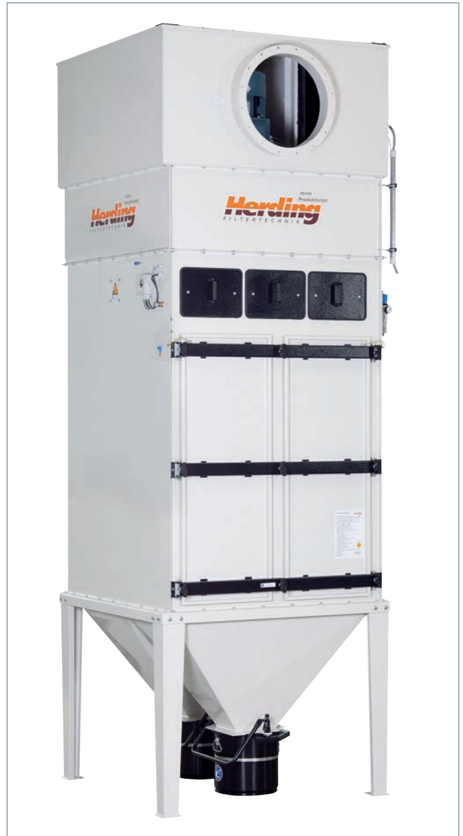
Herding Flex filter system

Extensive successful references with processes such as a mixing, grinding, sieving, bush hammering and sanding speak for themselves. Furthermore, Herding filter systems are used in the extraction of raw materials in quarries, in concrete block manufacturing and in all refinement processes in the concrete and stone industry. ■