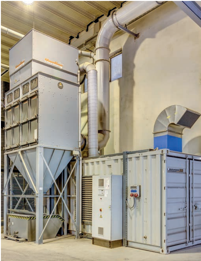
Booth extraction with clean air recirculation into a compressor room

deeper layers of the filter medium. The automatic cleaning of the filter surface by means of compressed air against the direction of flow is thus very reliable and efficient. The quality of the extraction performance remains constant over the entire service life.