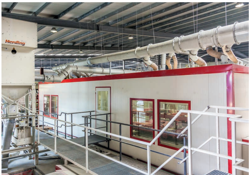
Herding Flex as a central filter plant in use at the Godelmann company

Surface filtration with the patented Herding sinter-plate filter has proven itself over many