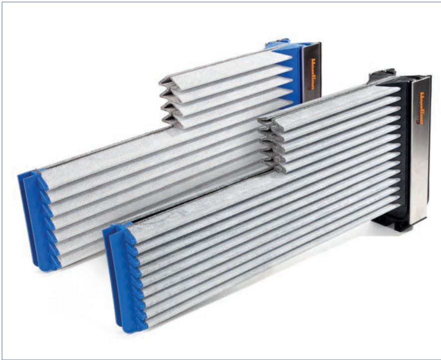
Herding Delta und Delta² filtering media

years to be an effective and reliable method of separating abrasive and ultra-fine quartz dust. Thanks to its sintered rigid PE body it is extremely resistant to mechanical stresses such as compressive forces or alternating pressure loads. A coating with PTFE is firmly embedded as a filter-active layer into the surface pores of the homogeneous rigid PE body. This combination of extremely stable and at the same time homogeneous sinter structure and the coating with PTFE embedded in it makes the sinter-plate filter so remarkable. The dust particles separated out of the exhaust air stream at the filter layer deposit themselves on the filter surface. Penetration through the filter-active coating into the rigid body is not possible. This pure surface filtration rules out the clogging of the filter due to the lodging of solid particles in deeper filter layers as is encountered in deep-bed filtration in fabric filters. The cleaning of the filter surface by so-called jet pulses - a compressed air pulse against the direction of flow - is thus very simple and effective. The low primary pressure necessary for this and above all the very short valve opening time provide for a low energy consumption for the cleaning. Efficient cleaning and the pure surface filtration result in an almost constant pressure drop behaviour of the filter over the entire life cycle of the filter systems.